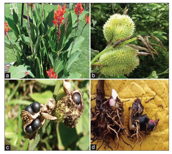
Fig. 1: (a) Plant of Canna indica , (b) Fruit of Canna indica , (c) A seed of Canna indica , (d) and Rhizomes of Canna indica

In America, wild species grow in the South of the United States, South America, from Venezuela to Argentina and India. Terrestrial plants usually live in tropical and subtropical rainforests, montane, premontane, and gallery forests. Palustrine plants grow in forest edges, wetlands, marshes, and riversides. Many taxa are nitrophilous and mostly found in humid loose soils, near streams, in uncultivated public lands or on roadsides. The plant prefers acid, neutral, and basic (alkaline) soils. It cannot grow in the shade. It needs moist soil good quality humus [10,11]. C. indica was the first species of this genus introduced to Europe, which was imported from the East Indies, though the species invented from the America [12] (Fig. 1).