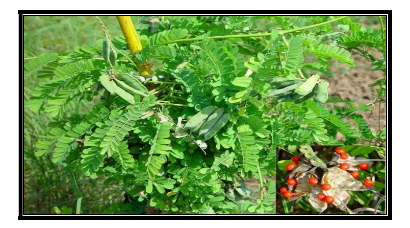
Figure 1: Picture of Abrus precatorius herb