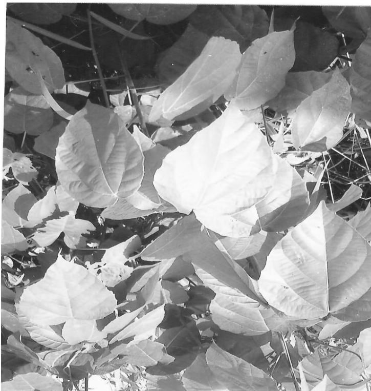
Figure 1. Fresh-leaves of Alchornea cordifolia .

the plant leaves using ampiclox as control.